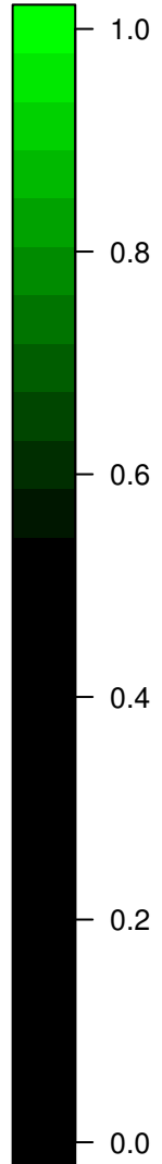
Classifier Output colorcode